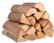
TREE (moisture content max. 20%)